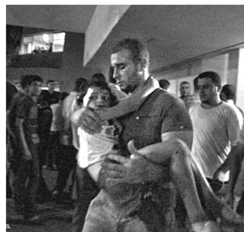
F-16 bombing in Gaza City, witnessed by an ISM volunteer from Manchester 30.7.10

Owns EDS Israel which provides the Israeli ministry of defense with an automated biometric access control system for Palestinian workers, in major checkpoints such as the Erez checkpoint (Gaza), Sha'ar Ephraim and Bethlehem checkpoints (West Bank).